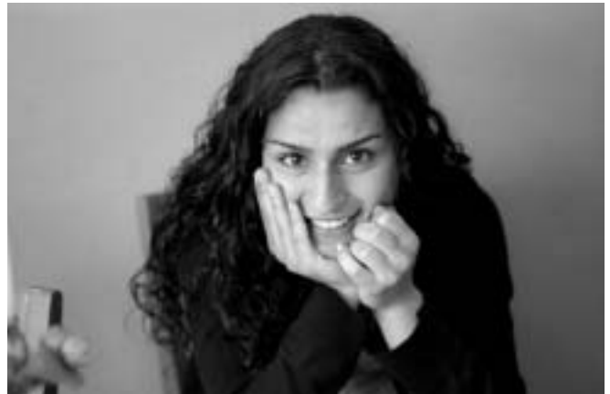
The teenage years are a time for seeking one's own identity and independence from the family.

One way to help the child in talking openly to others about MS is to present simple explanations about the disease and life with MS