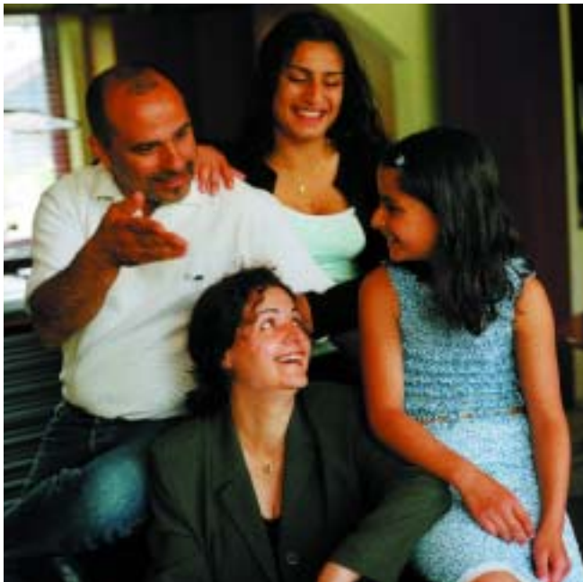
Open communication can help a family deal with MS.

receive appropriate information at the beginning. In order to confront these fears, it helps if the child feels that he or she can express them to the parent or to another person who is available to listen. MS society websites, support groups and informative literature may be helpful resources for older children with these types of concerns.