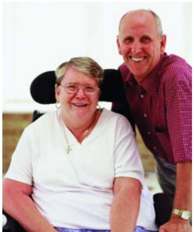
Sometimes listening is most important.

bathing, dressing or helping to use the bathroom. Some of these chores can be taken care of on a routine schedule. For instance, the house gets cleaned every Monday or the week's meals are prepared on Wednesdays and Saturdays. Other responsibilities, like helping to go to the bathroom, are completely unpredictable and must be addressed with alternative solutions, especially for those times when the carer must be out of the house.