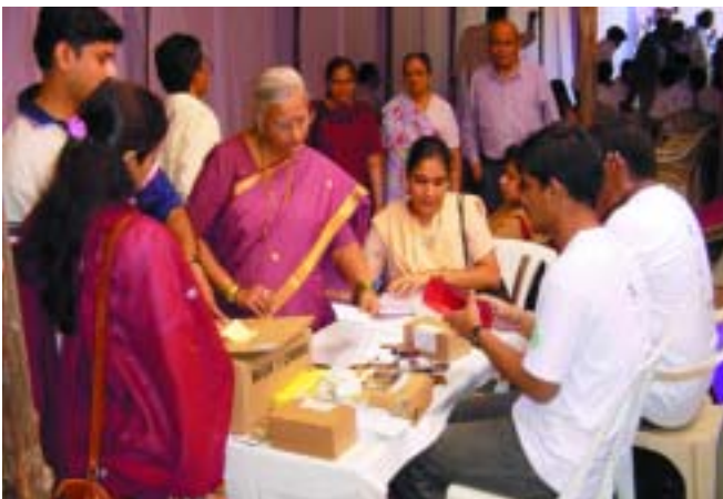
Medicines being distributed to people with MS.

There is a resting place for attendees where they can meet other people with MS. Wheelchairs and walkers are available to assist those with mobility difficulties.