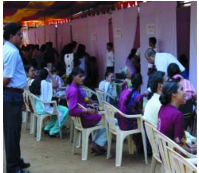
People with MS meet the doctors.

In India there is no financial help from government, nor public insurance for those who have MS. Medical consultation charges and treatment are beyond the reach of many. All too often, people with MS from deprived backgrounds bear their MS attacks silently, becoming more disabled without any support. Meanwhile, those who do visit the general hospital face long and distressing waits which can exacerbate fatigue and other MS symptoms.